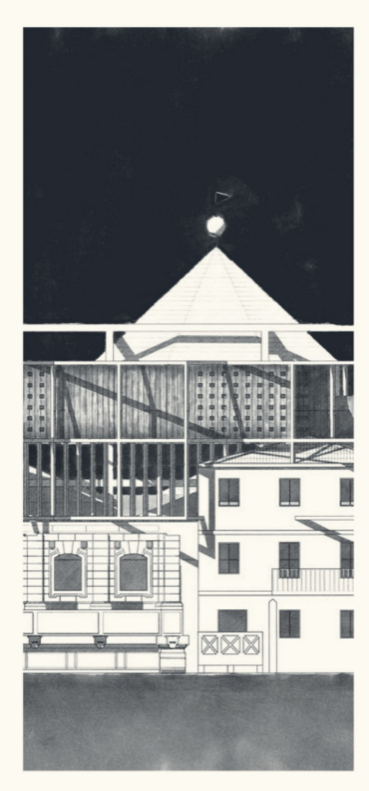
Fig. 2 Images taken from the volume, Venezianella and Studentaccio, the palace of the parties, Ca' Venier dei leoni, project by Benedetta Scarano, Caterina Solini.

aesthetic level: to the detriment of the 'bulimia' of images by which we are submerged daily, which is atrophic, here «Alla negatività del non-sense e dello sberleffo (DADA) si accompagna la volontà di costruzione, e quindi un modello di lavoro artistico metodico e scrupoloso»<sup>4</sup>. What remains?