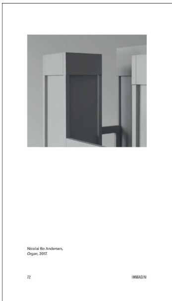
Fig. 1 Il recinto di Kairós. Sul modello e la sua autonomia, page 72.

ond meaning, the author understands the model as «a broad class of hypotheses [...] ideal, of [...] intuitive and creative origin [...]» 6 .