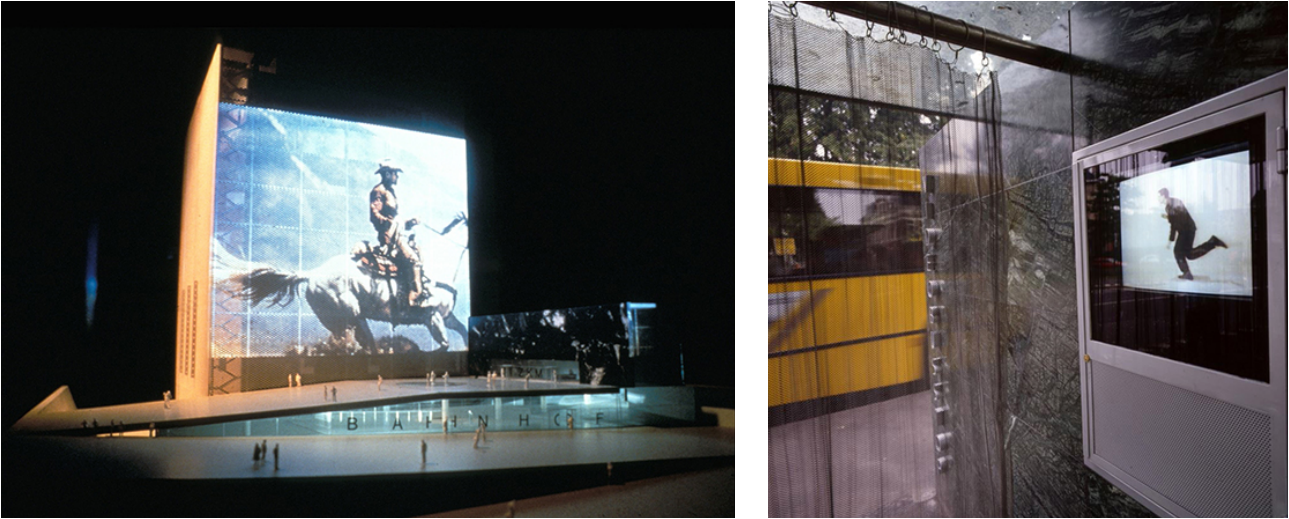
Fig. 1 Decorated sheds and screens. Left: Zentrum für Kunst und Medientechnologie, Karlsruhe. Competition Model, 1989. Right: Groningen Video Bus Stop, 1991

the publication in 1992 of a specific project, Villa dall’Ava; an intermediate one providing an account of the consequences of the 1995 release of S, M, L, XL , which would derive in Content , a decade later; and a final phase in which Koolhaas, frustrated by the burden of his public image, decided to shun his architect status and conventional photographic resources for this special issue of Domus . In the «Preface», as in other works such as «The Generic City», Koolhaas omits references to the authorship, intentions and means of production: «With this issue we try to (re)present four recent buildings in a fresh, more complex way. We don’t insist on the buildings’ qualities, but monitor their effects on their respective hosts and users. There are no ‘critics’—usually, best friends in drag—no intimidation» (Koolhaas 2006, unpagued). This disappearance of the figure of the critic ought to be seen as a final step in the progressive absorption of content and channels, one which had begun to take shape almost two decades earlier, in the summer of 1989.