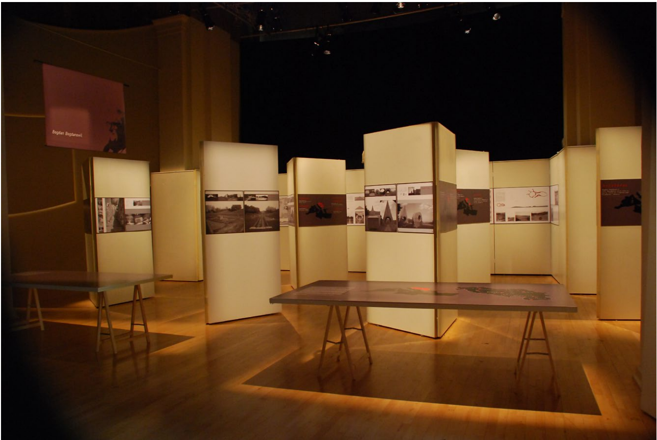
Fig. 14 Photographs taken during the Festival dell'Architettura di Parma, 2004–2014.

resonate in certain spaces of the city, while Fiore, Frommel and Calzona discuss modernity in public, and at the same time the theme of symbolic representation and its non-univocal meanings are investigated, according to a reading that is difficult to conclude, by Arturo Carlo Quintavalle in the case of the Baptistry of Parma, or finally precious treatises on architecture from the Palatine Library and drawings from the Academy of Parma, of which an important future exhibition is presented, become opportunities for reflection on the transmissibility of architecture and the educational role of schools. Many other contents of the Festival are demonstrative of this spatio-temporal extensiveness of exploration and research. Last but not least, the extraordinarily incisive one suggested by Salvatore Settis in his latest book The Future of the 'Classic' which even from the architect's point of view, well beyond the Portuguese misunderstanding, would become what it has been on other occasions, the stimulus to a close comparison not only between the Ancients and the Moderns, but also between "our" and "other" cultures.