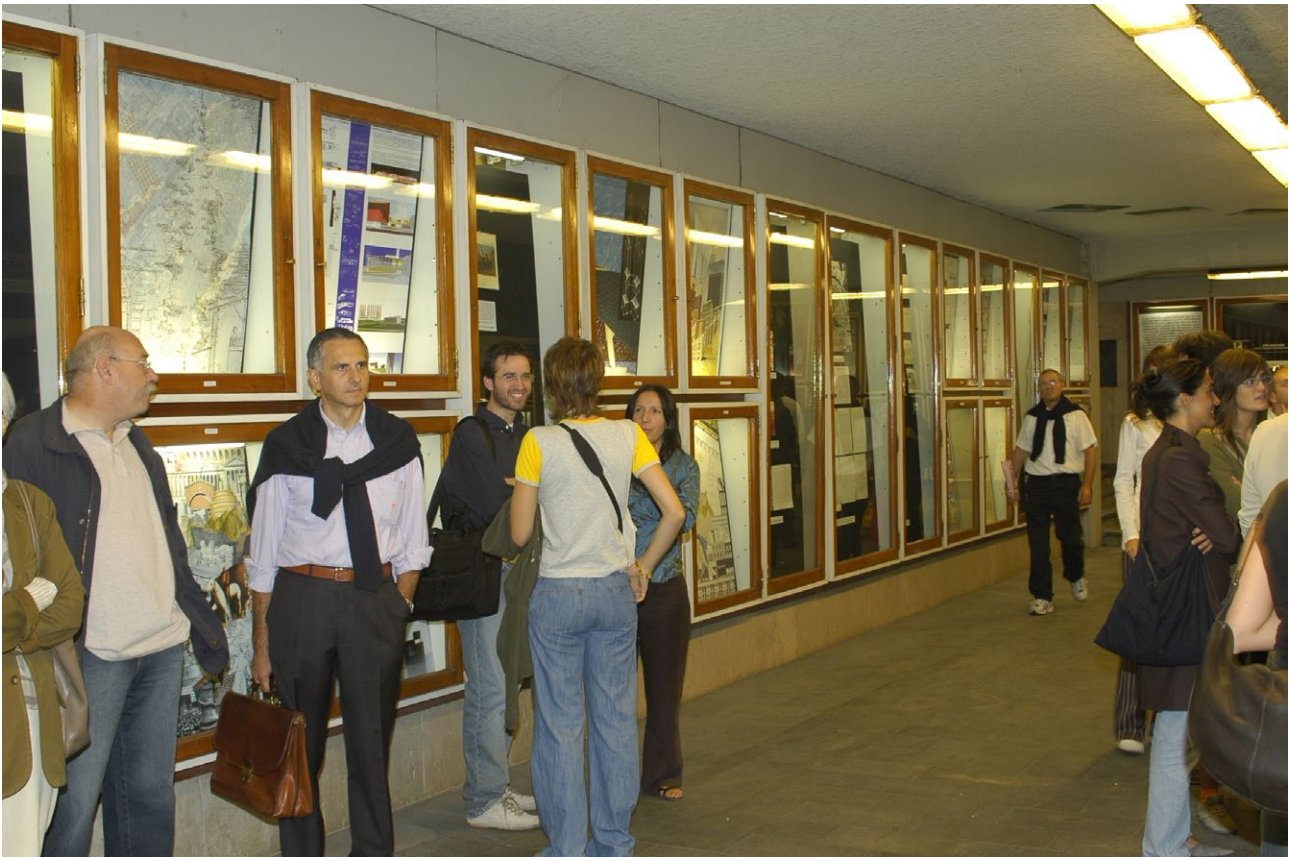
Fig. 12 Photographs taken during the Festival dell'Architettura di Parma, 2004–2014.

The need to increase the participatory aspect as much as possible and at the same time to start an action of exploration and knowledge starting from the Italian and European context, moves further forms of initiative such as that of competitions of which the exhibitions, meetings and evaluations in which the public is involved are the fruitive outcome. In this first edition, Italian municipalities were invited to nominate those architectural achievements considered significant for the identity of the contexts to which they belong ( Forum of Cities ), those of Emilia Romagna in a special session ( Architecture-Quality Award of the Region E.R. ) in support of what the Region is trying to operate through various legislative and programming initiatives, and finally the young designers ( Under 33 ) called to measure themselves on the theme of places of the night, and the playful, recreational but also behavioral dimension of youth phenomena. In other words, there is an attempt to rediscover an Italy of architecture (between schools, designers, public and private clients, administrations, construction and production companies) scarcely told through the media, much less the specialized ones, which evidently presents structural problems, conflicts and contradictions often capable of deeply undermining its intentions, but nevertheless responsible for the change that surrounds us extensively in the city and in the territory and which will produce the landscape in the near future.