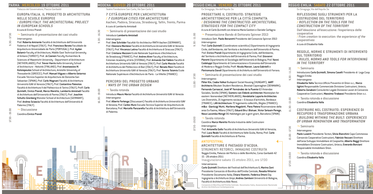
Fig. 6 Brochure of the Festival dell'Architettura di Parma, no. 6, 2011.