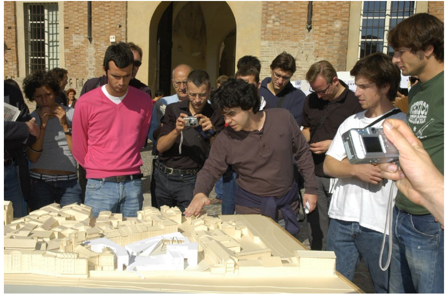
Fig. 11 Photographs taken during the Festival dell'Architettura di Parma, 2004–2014.