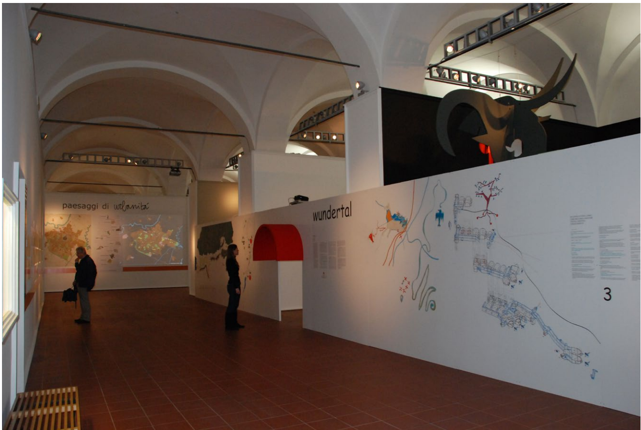
Fig. 10 Photographs taken during the Festival dell'Architettura di Parma, 2004–2014.