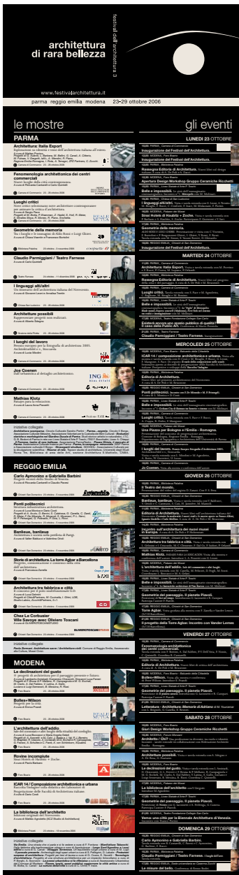
Fig. 3 Brochure of the Festival dell'Architettura di Parma, no. 3, 2006.