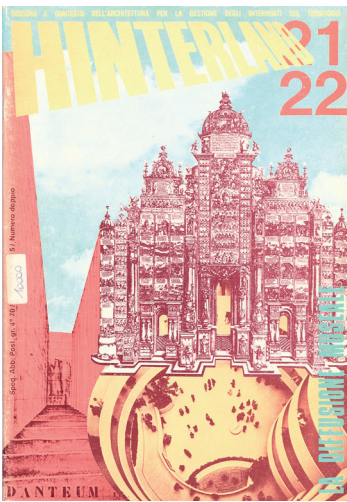
Fig. 2-3 The covers of “Hinterland” nos. 4/1978 and 21-22/1982, dedicated to museums.