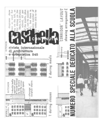
Fig. 2 1960, Journals and publications dedicated to the theme of the school

Upon closer inspection, there has been pedagogical experimentation in the close relationship with the learning space. Various perceptive experiences – starting with the foundations mentioned above – have begun to innervate Italy from north to south, adhering to a more intimate, less evident revolution. But, under the impulse and apparent albeit inadequate contingency of abundance of a broad heritage of school building, it has been content with a timid internal transformation, and changes in perspective supported more by learning tools than by physical space. Individual experiments, often driven by lofty ideals, hardly ever made it to the level of national debate as a real possibility for a joint rewriting of the school system from a ministerial perspective.