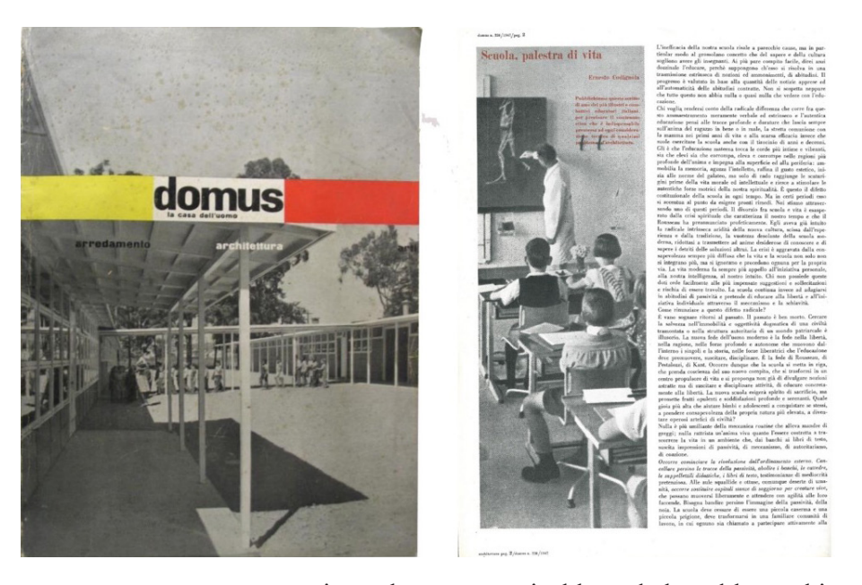
Fig. 1 The cover and editorial of Domus "La Casa dell'uomo", no. 220, June 1947 dedicated to the theme of the School.