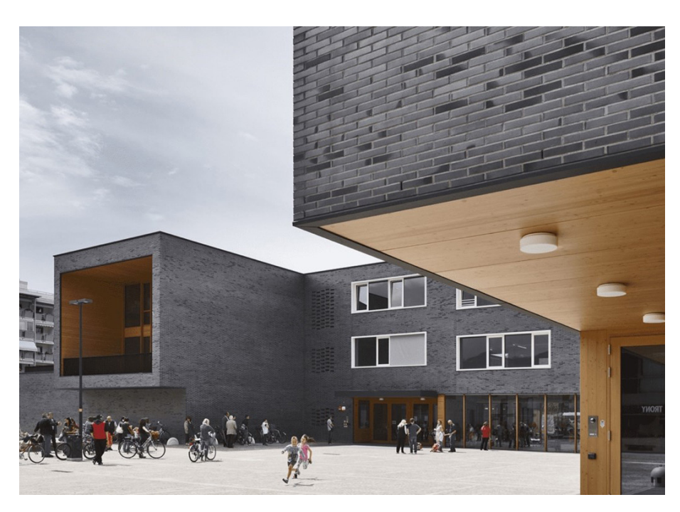
Fig. 4 Modus, Architects, School complex and district library, Firmian, Bolzano, 2014.

The revolution in Alto Adige – not far from Alberto Samonà's idea of coincidence between the educational programme and architectural organism for a 1964 competition for a compulsory school in Bologna – perhaps lies in the possibility of placing the relationship between "space and learning" before the more canonical preparation of an architecture competition aimed at defining a school. In this way, architects are forced to shape the teaching plans or moments, general thoughts about a possible educational idea, before responding to dimensions or regulatory requirements. The result is an idea of an extended school, an idea of a community and, in a sense, an idea of a city.