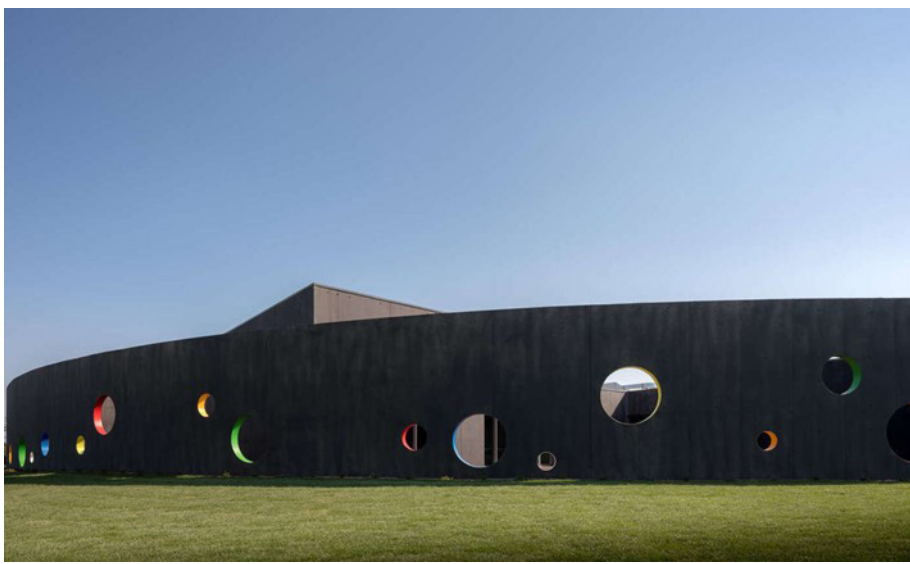
Fig. 6 Alberto Campo Baeza, Benetton Daycare Center, Ponzano Veneto, Treviso 2007.